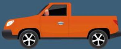
Vehicles (steering wheel, dash, brake, etc.)