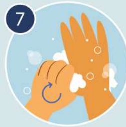
7 Rub the left thumb in a rotary motion and vice versa