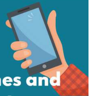
Phones and cell phones