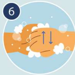
6 Rub the back of the fingers of one hand with the palm of the opposite hand, holding your fingers