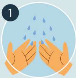
1 Wet your hands with water

This process should last from 40 to 60 seconds