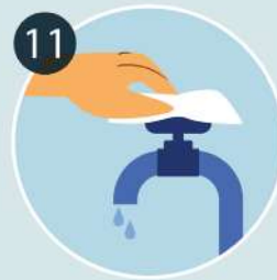
11 Use the towel to turn off the tap