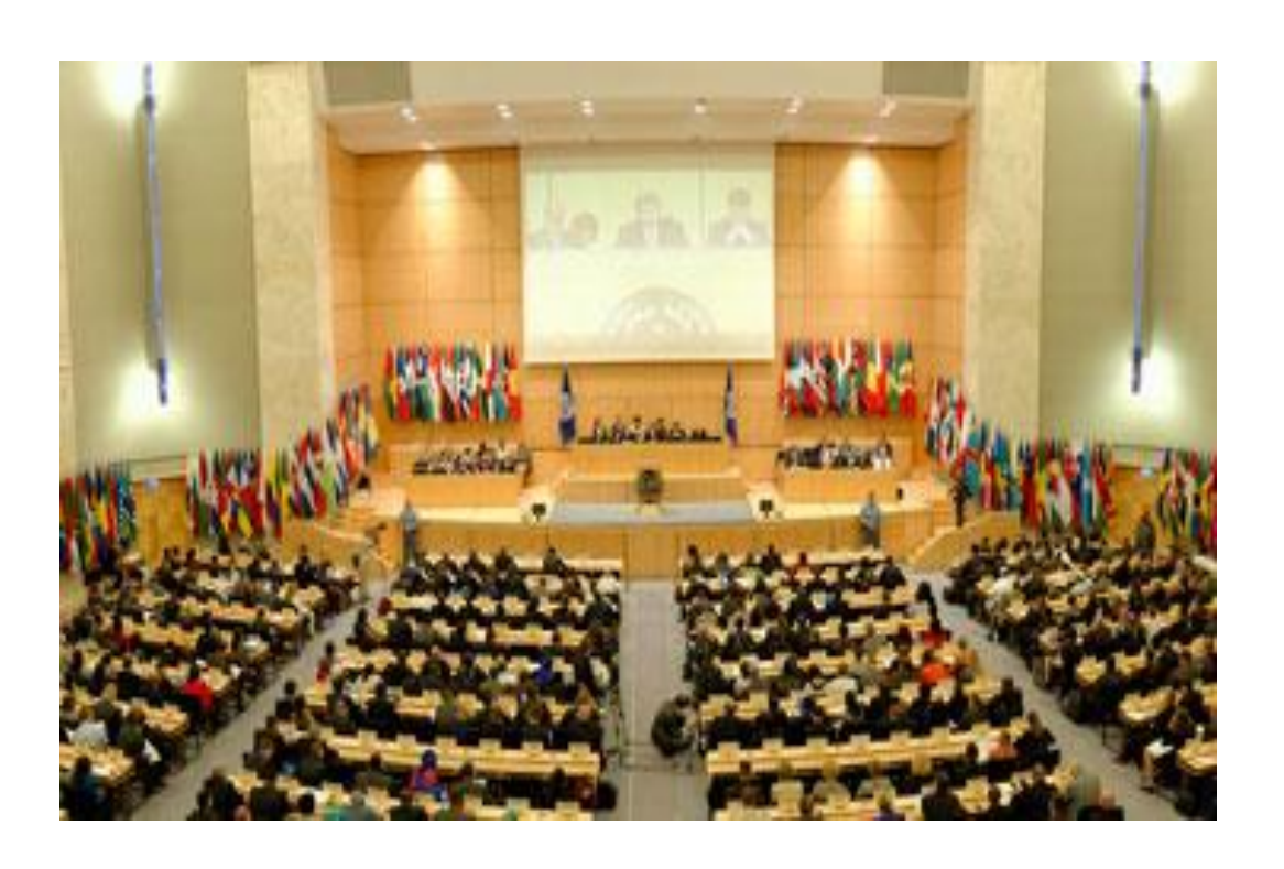
International Labour Conference